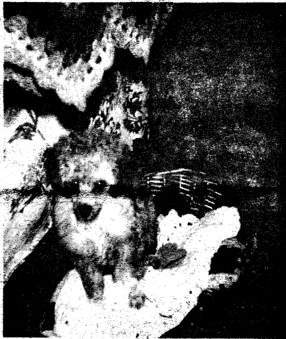
"Princess Rose" Grimes

Registered Toy Poodle Apricot with white face. Soft, loving and hugable